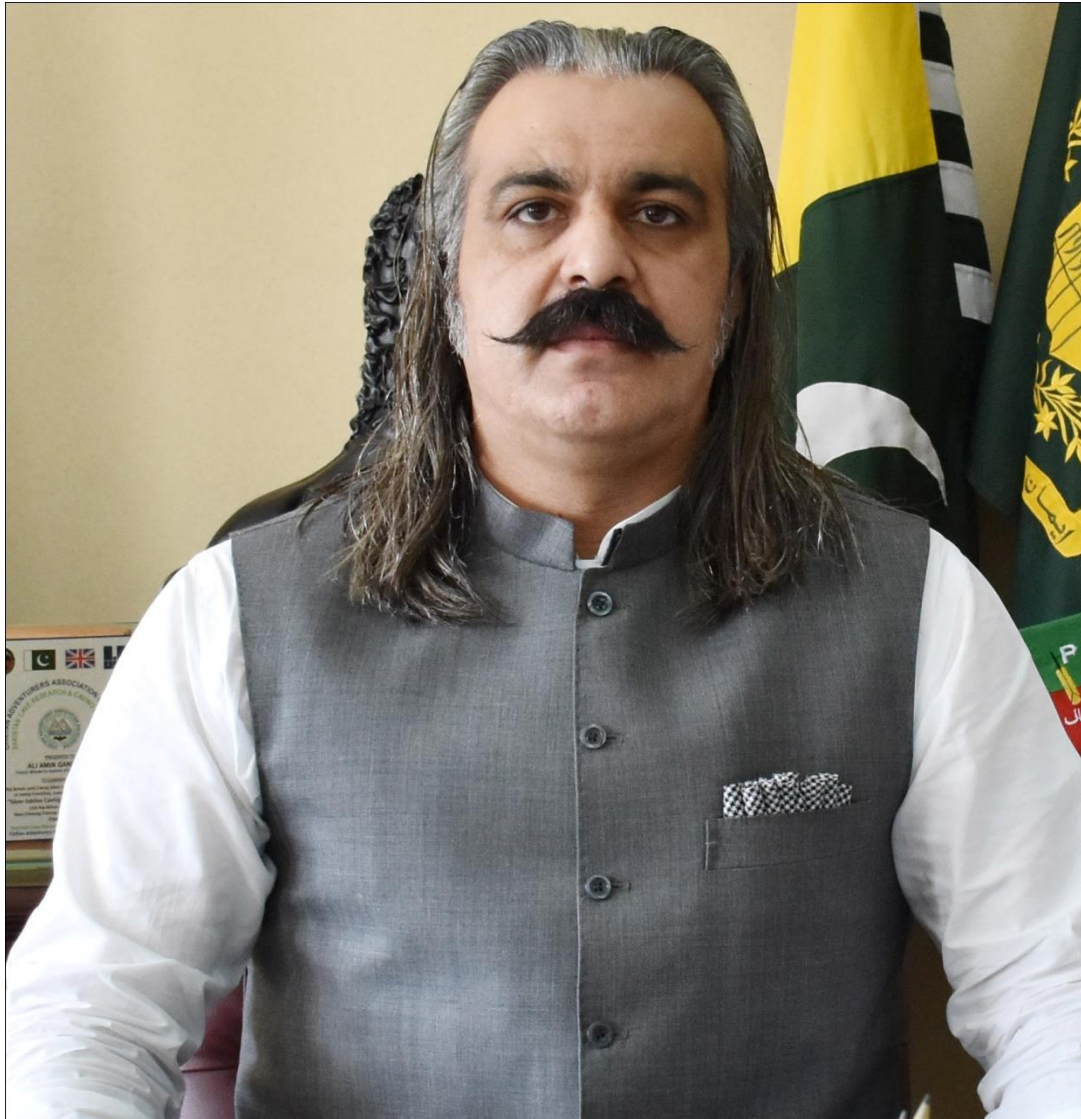
Ali Amin Khan Gandapur Federal Minister for Kashmir Affairs and Gilgit-Baltistan